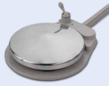
Disc foot control