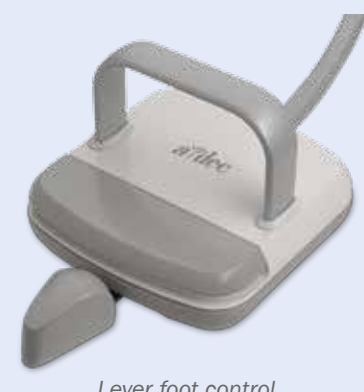
Lever foot control

Fingertip access simplifies chair adjustments and provides quick access to dental light and cuspidor control. Optional deluxe touchpad adds controls for integrated clinical devices such electric motors, cameras, and scalers.