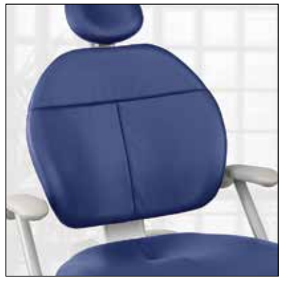
Sewn upholstery with armrests