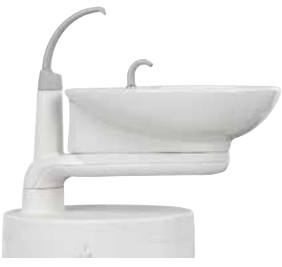
Rotating vitreous china cuspidor