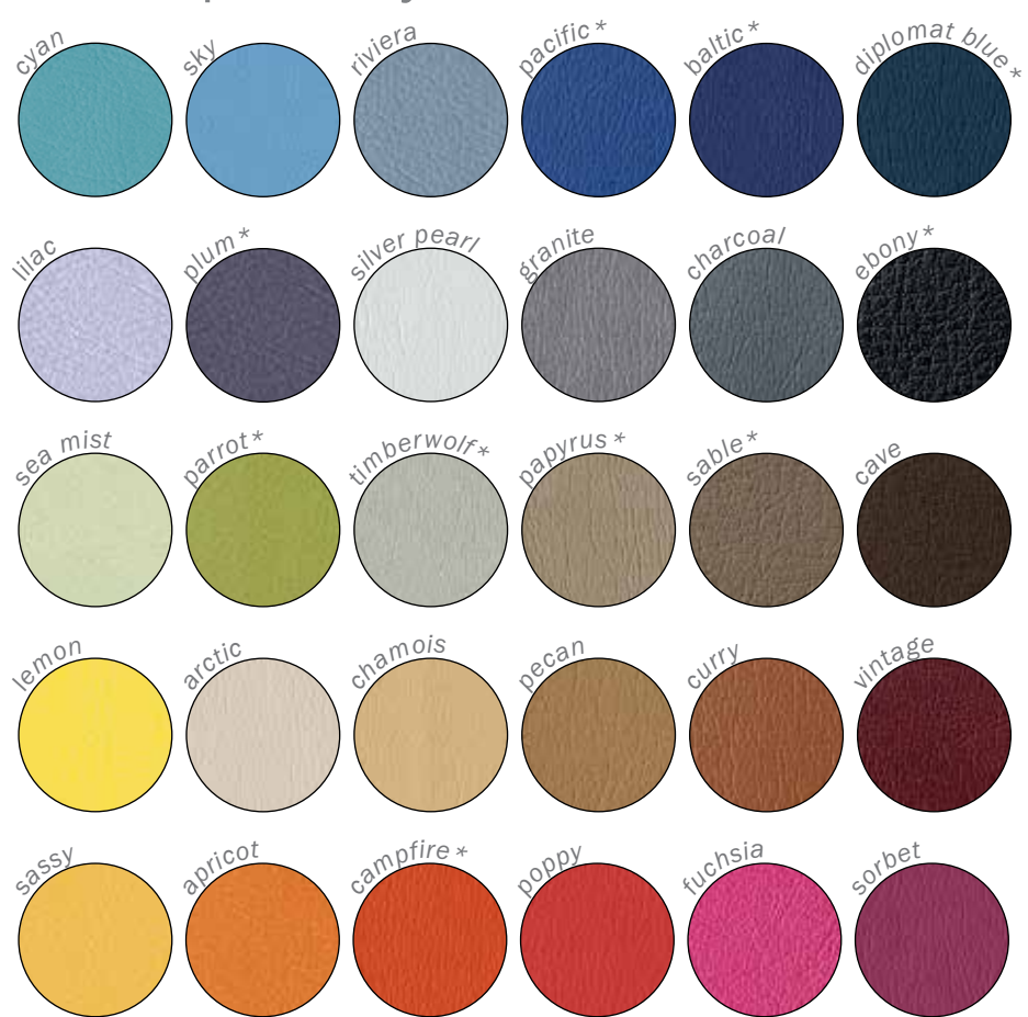
Order Your Samples at a-dec.com/InspireMe

* Sewn colors that complement seamless colors.