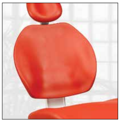
Seamless upholstery without armrests