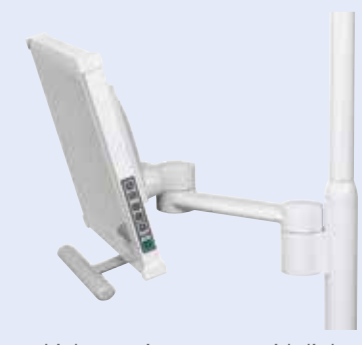
Light monitor mount with link arm