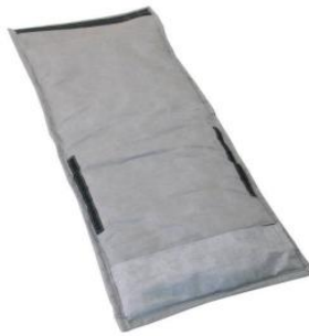
Wand Thermal Cover